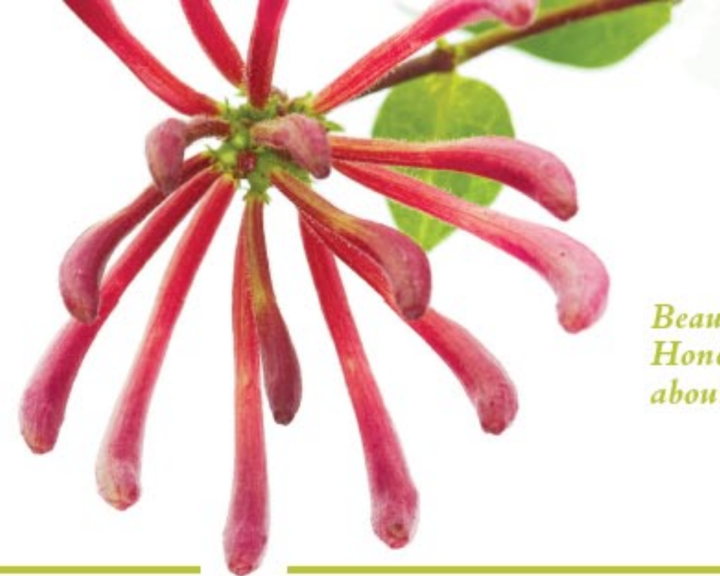
Beautiful, fragrant Honeysuckle: it's not all about cutting